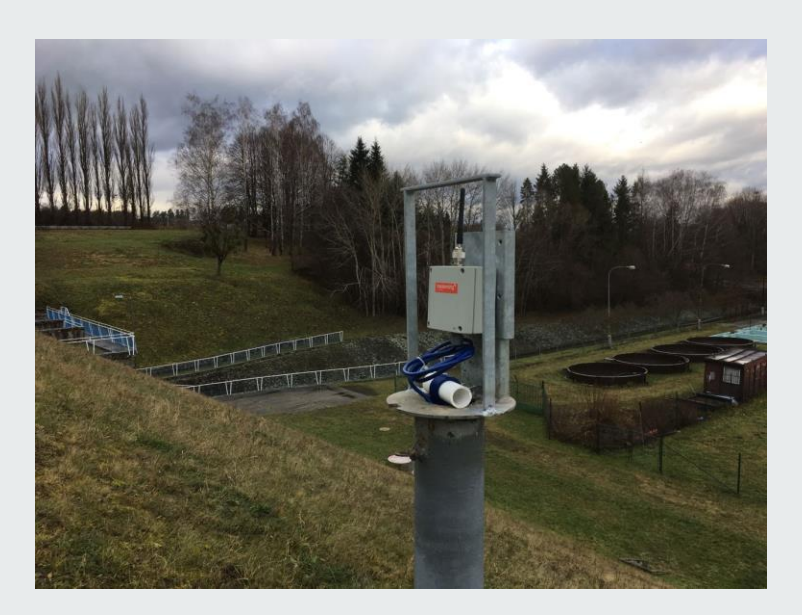
Loadsensing data node installation at the Olešná Dam

The real-time data collected and displayed in the visualization software enables the configuration of different alarms and alerts which can be used not only for emergency situations but also for the long-term maintenance of the dam structure.